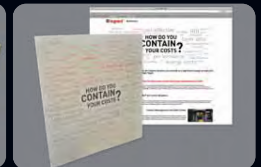
Digital Mailers with PURL and Personalized Landing Page