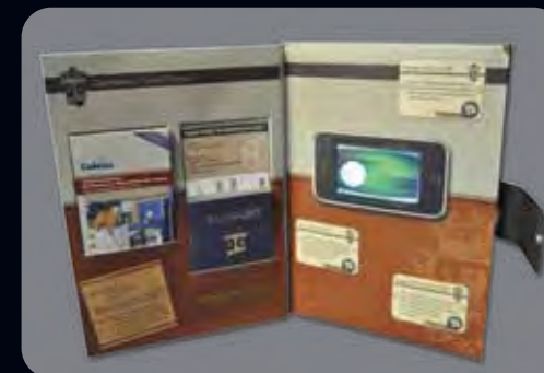
Custom Digital Packaging Complete with Audio and Video