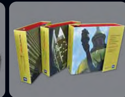
Personalized Proposal Binders